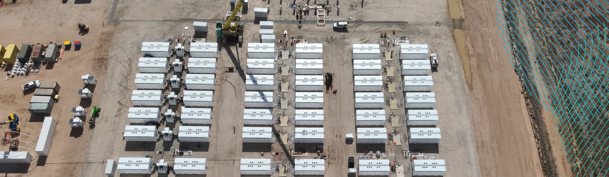
Photo: MV Transformers and switch room preparation, April 2025